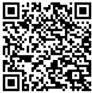
Edsby for Parents