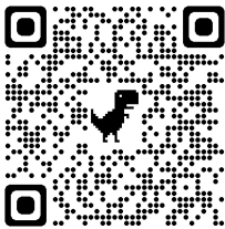
Grade 1-9 Grading Scale

Click on the QR code to access Edsby for Parents - Find lots of frequently asked questions & get help navigating through Edsby.