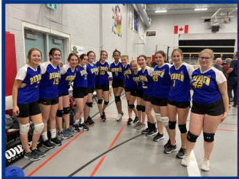
Regionals in Rose Valley