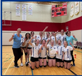
Canwood Tournament Champions!