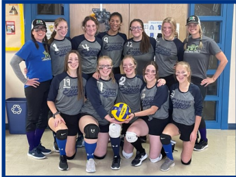
Medstead tournament (Halloween-themed - baseball players)