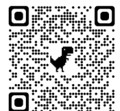
PAA noon meal prep video.