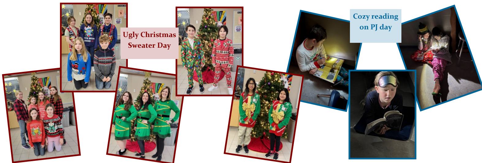
Cozy reading on PJ day